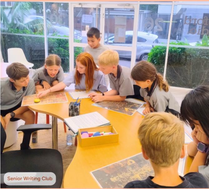
Senior Writing Club