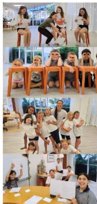
Right next to Ponsonby Intermediate School!

Register interest now for Tuesday 1:1 lessons or Youth Choir